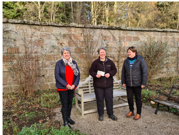
Donation From Baldarroch Crematorium

Both of these donations are much appreciated so a big thank you to them.