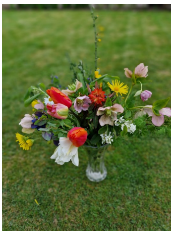
Spring Flower Bouquet